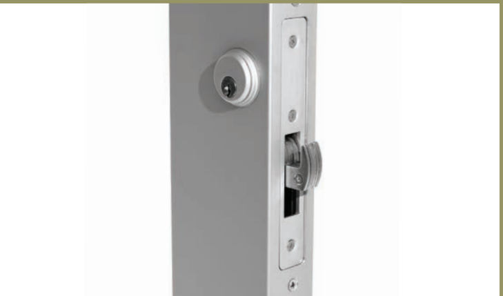
Type C Lock

Our premium handle features a minimal one-piece design and comfortable grip. Finish choices are available in brushed nickel or black. Available only with the 4.71" stile (aluminum and thermally broken aluminum) and the 2.79" thermally broken aluminum stile.